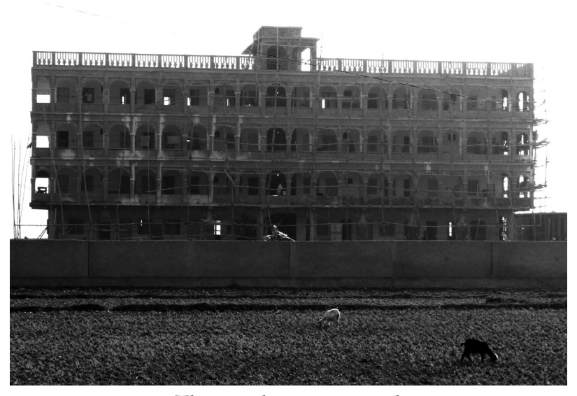
The newly constructed 'Śrī Hāḍāi Paṇḍit Padmāvatī-devī Smṛti Kuñja' in Śrī Ekachakrā Dhām (now known as Bīrchandrapur).