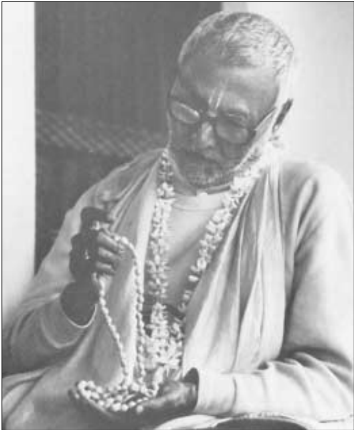
His Divine Grace Śrīla Śrīdhara Mahārāj chanting the Hare Krishna mantra softly on the tulasī beads of the japa-mālā .

order. We must not think that He is made of material stuff. When we go and stand before the Deity, we should not think that we can see Him, but that He is seeing us. He is in the subjective plane; I am His object.