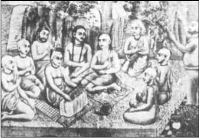
A sixteenth century painting of Śrī Chaitanya Mahāprabhu and His associates discussing Śrīmad-Bhāgavatam .

will find the key, the clue to the proper world where life is worth living.