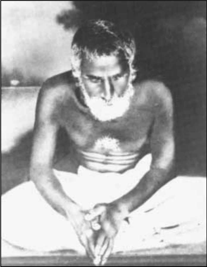
Śrīla Gaura Kīśora Dāsa Bābāji Mahārāj