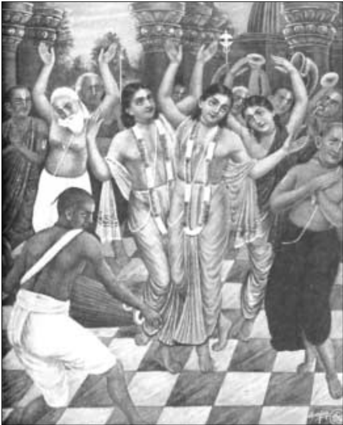
Śrī Chaitanya Mahāprabhu and associates ecstatically chanting the Hare Krishna mahā-mantra .

index finger, which is generally considered inauspicious, should not touch the beads, but should remain outside the bag. Generally we use the thumb and middle finger to count. One should chant sixteen rounds, as recommended