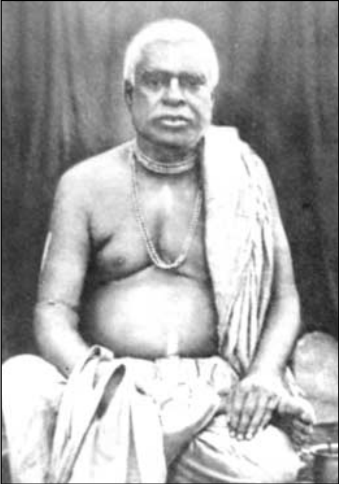
Śrīla Bhaktivinoda Ṭhākura