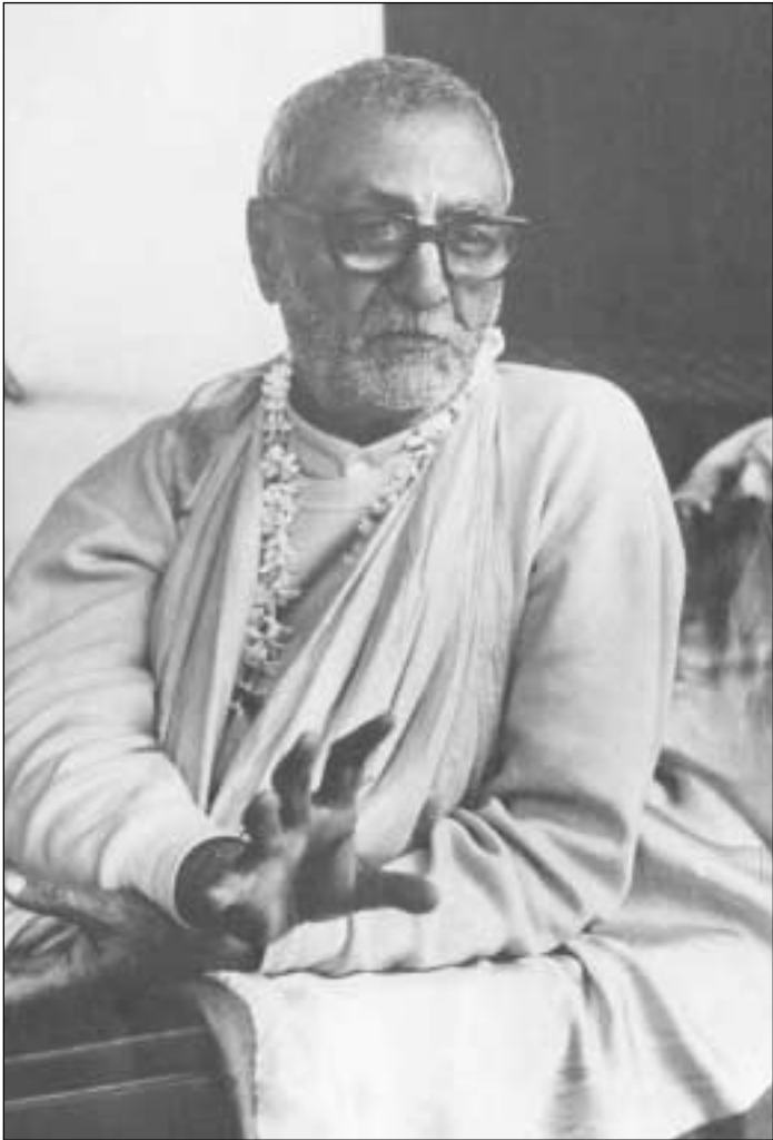
Śrīla Śrīdhara Mahārāj lecturing at his āśrama in Nabadwīp, India. “The association of scriptures and saints can help us achieve the ultimate realization.”