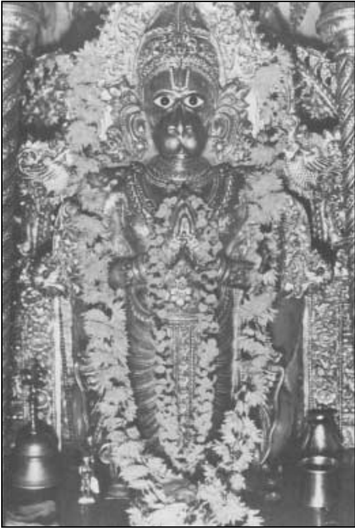
Deity of Hanumān, the devoted servant of Lord Rāmacandra.