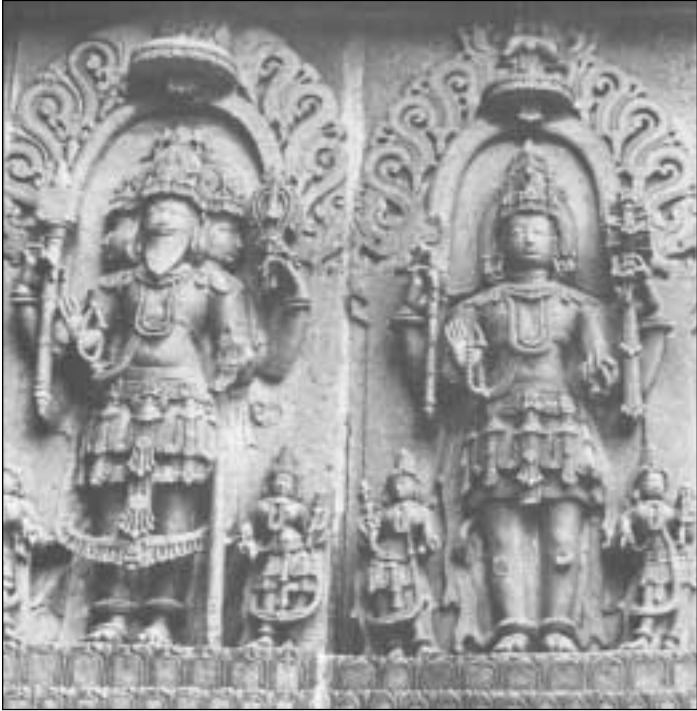
South Indian relief of Lord Brahmā, the creator of the universe (left), and Lord Śiva, the universal destroyer (right).

Vedas singing praise to Lord Brahmā. Nārada, who was also his son and disciple, approached Lord Brahmā saying, “How greatly fortunate you are! You are entrusted by Lord Nārāyaṇa Himself with the management of the whole universe, and sometimes you visit Him for guidance in the administration of the universe. We also find that some portions of the Vedas are engaged in singing your glories. You are so fortunate!”